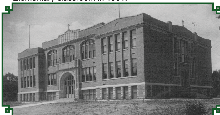
St. Mary's Catholic School in 1914. The total cost of the new building and furnishings was $63,644.95.