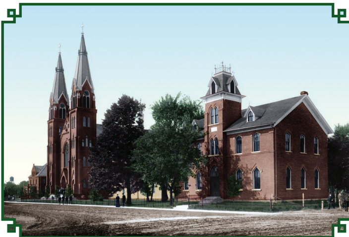
First school building completed the summer of 1883. Photo restoration completed by Michael ('89) Sellner.