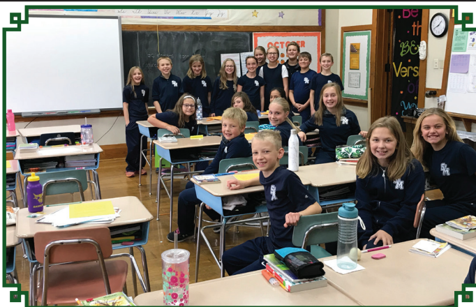
Elementary classroom in 2018.