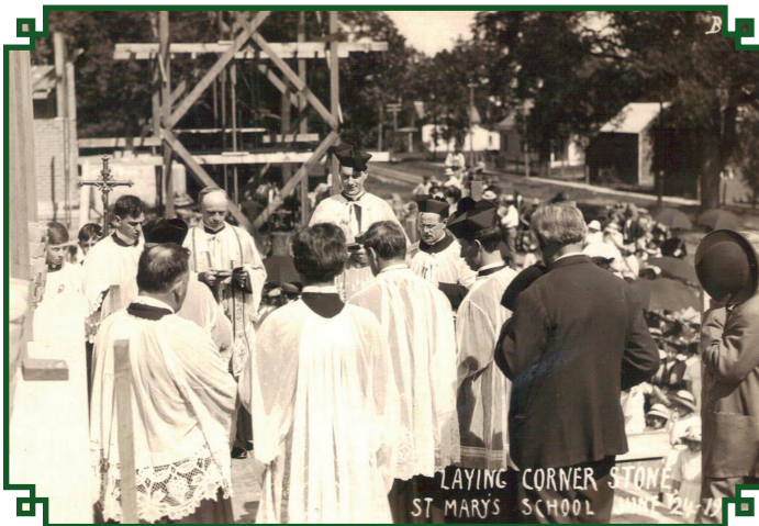
The cornerstone of the present grade school building was blessed and laid on June 24, 1914.