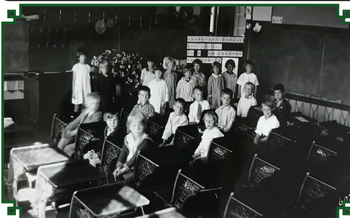
Elementary classroom in 1931.