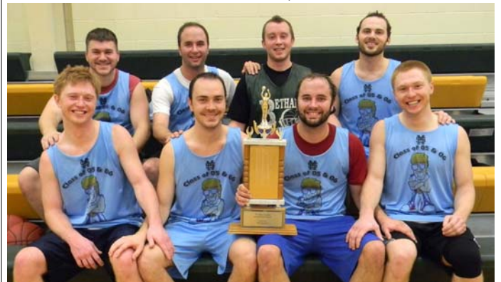
Team 2005-2006 won the tournament last year.